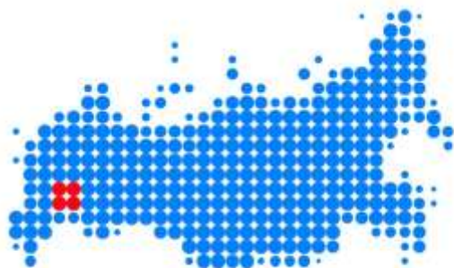
Conceptual Master Planning of Kazan Smart City Republic of Tatarstan, Russia