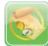
Service Industry & Tourism