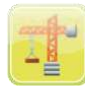
Construction, Building materials & Furniture production