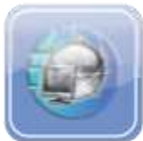
IT & Telecommunications