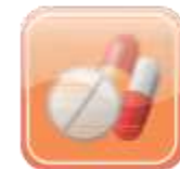
Health & Pharmaceuticals