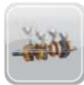
Machinery & Automotive parts