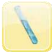
Chemicals & Petrochemicals